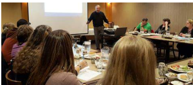
Understanding Business Financials Workshop

The CCEDC understands that many entrepreneurs and small business owners start companies based on an idea or expertise, not financial knowledge. It is vital for these entrepreneurs to understand business finances and what drives a business' financial success. Understanding financial reports allows them to detect a business' strengths and weaknesses and is a tool to improving profitability and making effective business decisions. For that