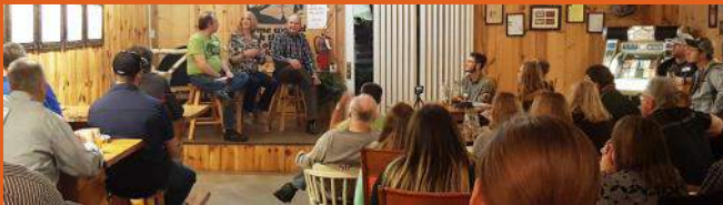
Musky Tank Mixer at Bloomer Brewery

The CCEDC in a collaborative partnership with Musky Tank LLC, Dunn County EDC, Eau Claire Area EDC, and the Eau Claire Chamber of Commerce host a series of mixers designed to bring together small businesses and entrepreneurs to discuss appropriate topics. Partners take turns holding these social and information mixers which consist of a panel discussion, Q & A, and networking. The October mixer was hosted by the CCEDC and took place at the Bloomer Brewery. The topic was market determination and research and how it fits into your business plan. Over 50 small businesses and entrepreneurs attended this mixer. From Concept to Reality was the topic of the November Musky Tank Mixer hosted by the Eau Claire EDC where the UW-Stout Manufacturing Outreach Center provided information regarding their Fab Lab and how it can assist entrepreneurs and small businesses. Plan to attend the next Musky Tank Mixer at Lucette Brewing Company in Menomonie in January 17, 2018.