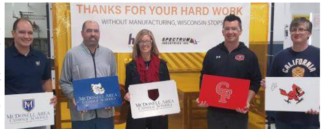
Spectrum Industries, Chippewa Falls

On October 23, 2017, Spectrum Industries in Chippewa Falls opened their doors to the Chippewa Falls High School athletic coaches and leadership team. Since these leaders have a positive influence on the future workforce of the Chippewa Valley Spectrum Industries took the opportunity to showcase their high-tech manufacturing operations, specifically to participate in a demonstration of one of Spectrums newest pieces of equipment which cut and bent the metal to create school logo signs.