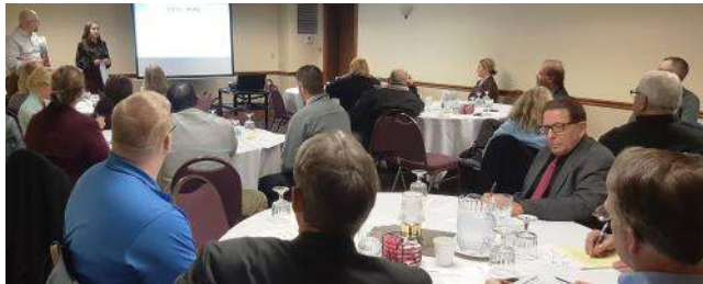
Career Exploring Update

A Career Exploring Update was held for businesses, educators, and elected officials to receive and update and provide feedback regarding the Chippewa County Career Exploring Program, a skills gap initiative designed to assist Chippewa County young adults make a more informed decision about future careers and determine if a particular career is right for