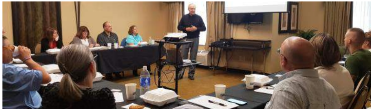
Attracting & Retaining Great Team Members Workshop