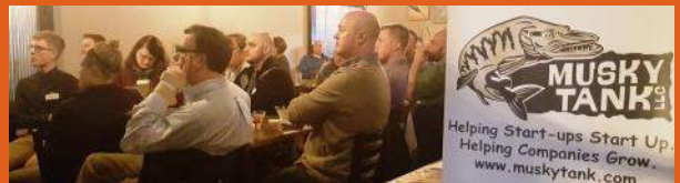
Concept to Reality Discussion

The CCEDC in a collaborative partnership with Musky Tank LLC, Dunn County EDC, Eau Claire Area EDC, and the Eau Claire Chamber of Commerce host a series of mixers designed to bring together small businesses and entrepreneurs to discuss appropriate topics. Partners take turns holding these social and information mixers which consist of a panel discussion, Q & A, and networking. The