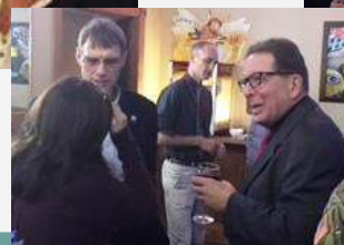
Workforce Partners Networking Reception