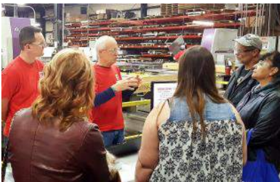
AJ Manufacturing, Bloomer

The CCEDC celebrated Manufacturing Day with A.J. Manufacturing in Bloomer. On October 12, 2017, A.J. opened their doors to students, community members, and the business community to highlight A.J.'s manufacturing capabilities, products, and materials with an emphasis on recruiting talented individuals and communicating the importance of manufacturing. During this daylong event A.J. toured visitors through their HVAC door and panel production area where they were able to observe the robotic welder, turret presses, steel roll former and sheet metal bending operations.